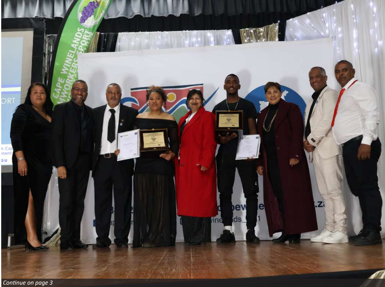
Continue on page 3