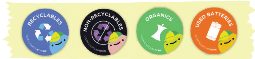
Home Bin System: 4 Sticker Set. Available soon!

As part of the Educational Toolkit for households a home bin system sticker set has been designed to turn everyday waste sorting into a simple household habit. You are encouraged to gather any 4 containers you already have at home, stick a Sunny sticker on each container and sort with Sunny!