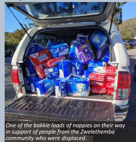
One of the bakkie loads of nappies on their way in support of people from the Zwelethemba community who were displaced.