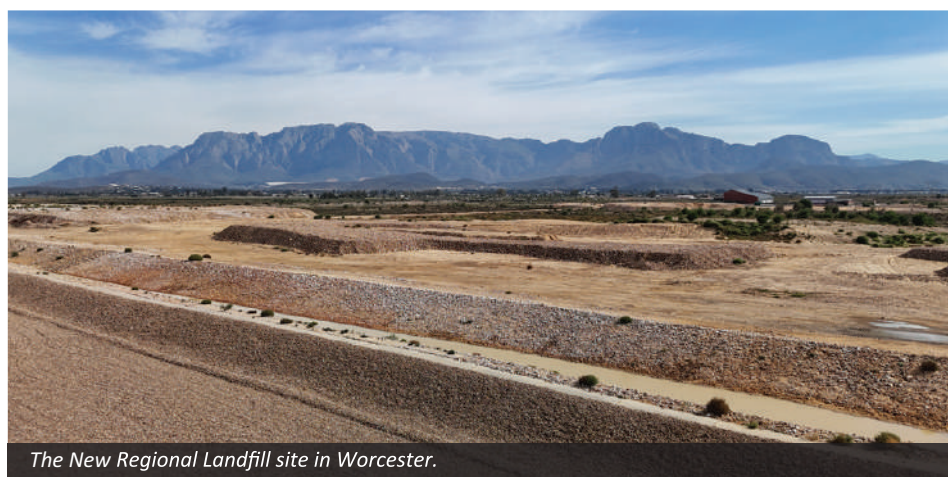
The New Regional Landfill site in Worcester.

Alongside various partners, the Cape Winelands District Municipality celebrates the opening of a new regional landfill site in Worcester. The goal is to keep it in use for as long as possible. So be lekker, reduce and recycle!