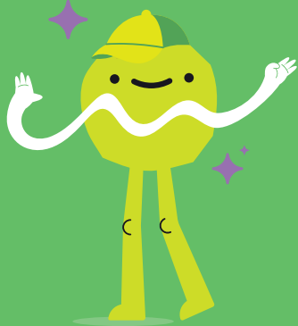
Sunny the Sun

High above the beautiful valleys and vineyards of the Cape Winelands, the sun rises every morning to watch over the communities of the region. But one special sun decided that simply shining light was not enough: Sunny.