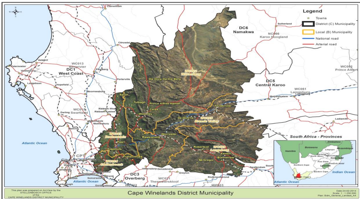
Map 1: Jurisdiction of Cape Winelands District Municipality (DC2) that includes the local authorities of Stellenbosch, Drakenstein, Langeberg, Breede Valley and Witzenberg.

The Cape Winelands District Municipality's (CWDM) jurisdiction includes the local authorities of Stellenbosch, Drakenstein, Breede Valley, Langeberg, and Witzenberg as reflected in Map 1 and CWDM has its own road maintenance teams situated in Stellenbosch, Paarl, Worcester, Robertson and Ceres performing an agency road maintenance function on the provincial road reserves.