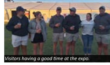
Visitors having a good time at the expo.