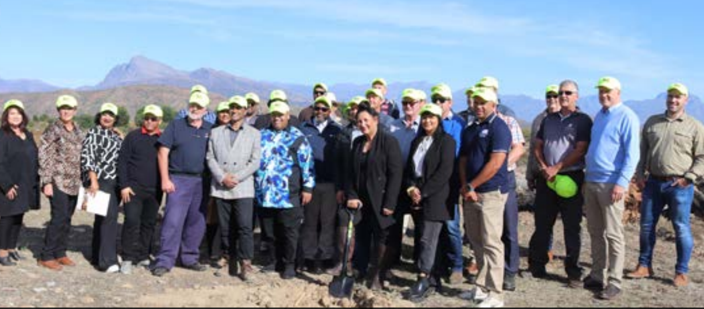
The Cape Winelands District Municipality (CWDM) and various partners attended the groundbreaking ceremony of the long-awaited regional landfill site in Worcester.

The CWDM will launch an extensive awareness campaign later this year to enhance mutual understanding of the roles and responsibilities of residents, stakeholders and partners in effective waste management.