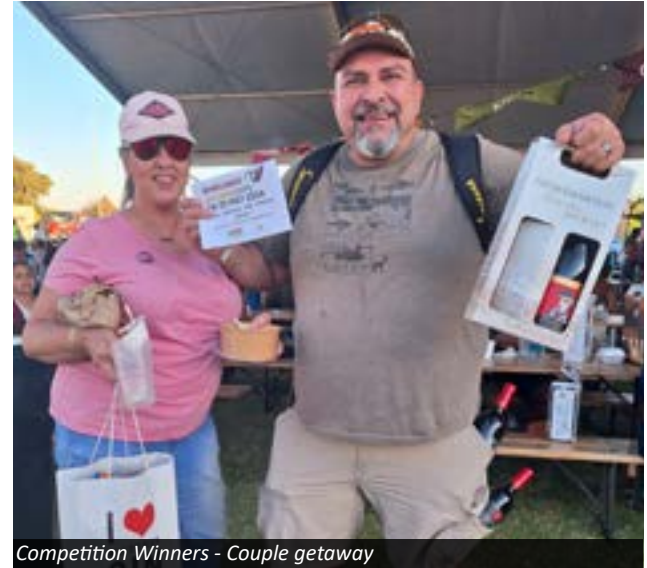
Competition Winners - Couple getaway

The success of the inaugural event has cemented the possibility of bringing the Wineland Autumn Expo to the region annually. We look forward to bringing you even more of what the Cape Winelands has to offer in 2025.