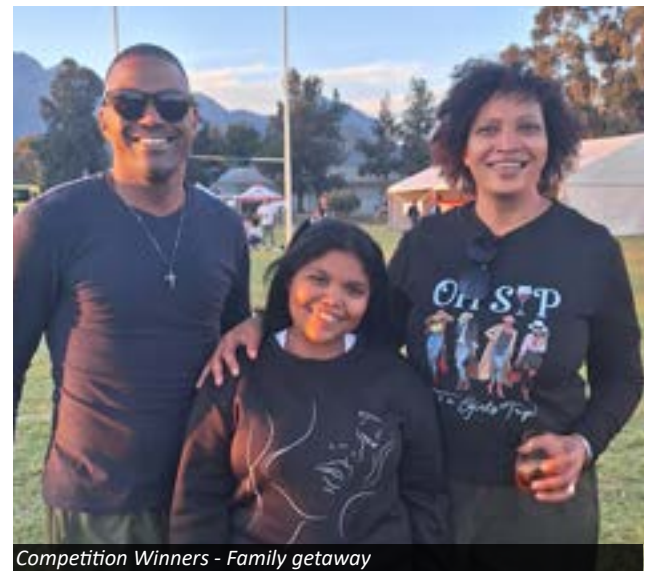
Competition Winners - Family getaway