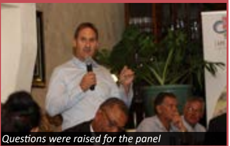
Questions were raised for the panel