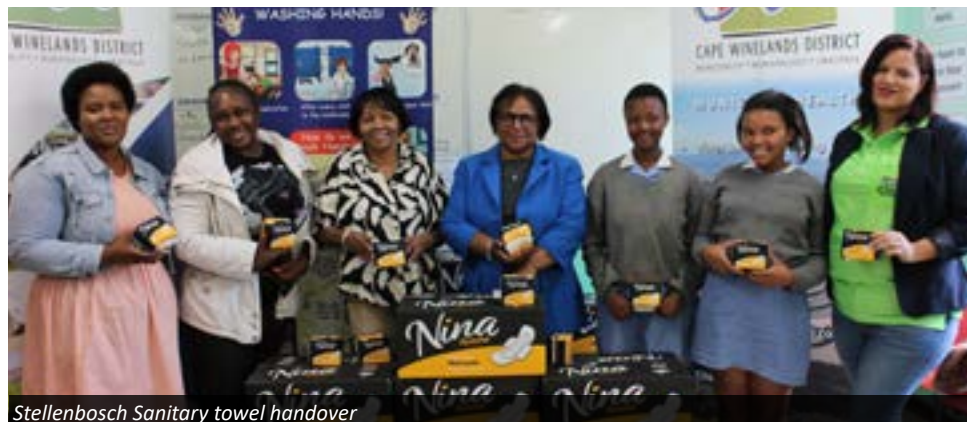
Stellenbosch Sanitary towel handover