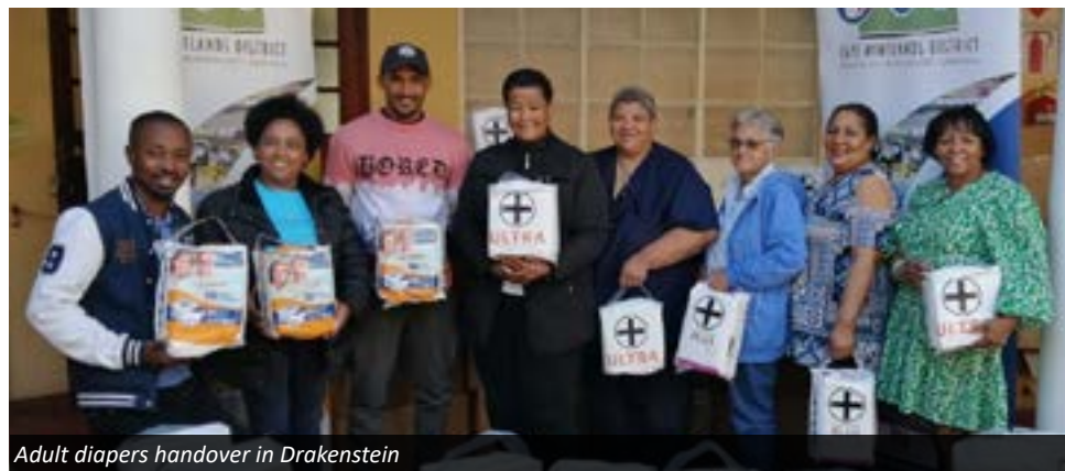
Adult diapers handover in Drakenstein

girls’ hygiene and preventing missed education days. Additionally, 1 122 adult diapers were distributed to care centres for the elderly and disabled. The CWDM remains committed to promoting dignity and wellbeing in the community.