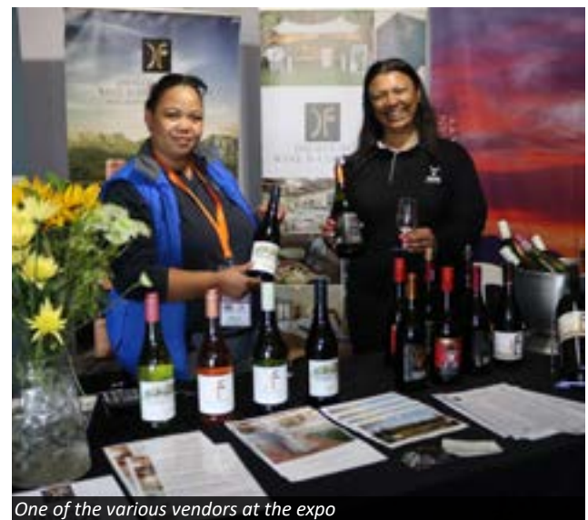
One of the various vendors at the expo