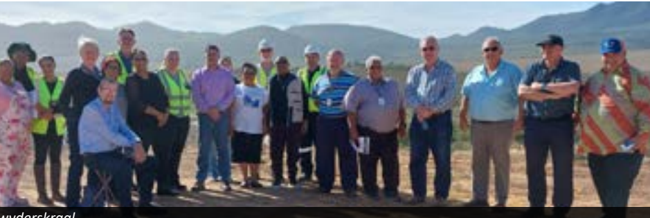
Karwyderskraal The CWDM's MPAC and Technical Services unit visited the Overberg District Municipality's regional landfill site. The visitors were highly impressed with this well-run, eco-sensitive site.

UMasipala wesiThili waseCape Winelands waya kumsitho wokwenza e ingqulelo kwendawo yenkunkuma yesithili entsha eVostle (Worcester). Uncedo lobugcisa lekarhulumente, elixabise malunga nesigidi esili-R104, liya kusebenza eBreede Valley, eWitzenberg naseLangeberg. Kugininiswa kwimfanelo yommandla le ndawo iya kuba yeyokugqibela apho kunokuchithwa khona inkunkuma engenakuphinda isetyenziswe okanye yenziwe ngokutsho. Ikontrakta ijilise ukuhambisa umthwalo wokuqala phakathi ngowama-2025. Uququzelelo lwengqiqo lwexhasa elizayo luya kwandiswa ukuqonda imfanelo neendima zolawulo lwenkunkuma.