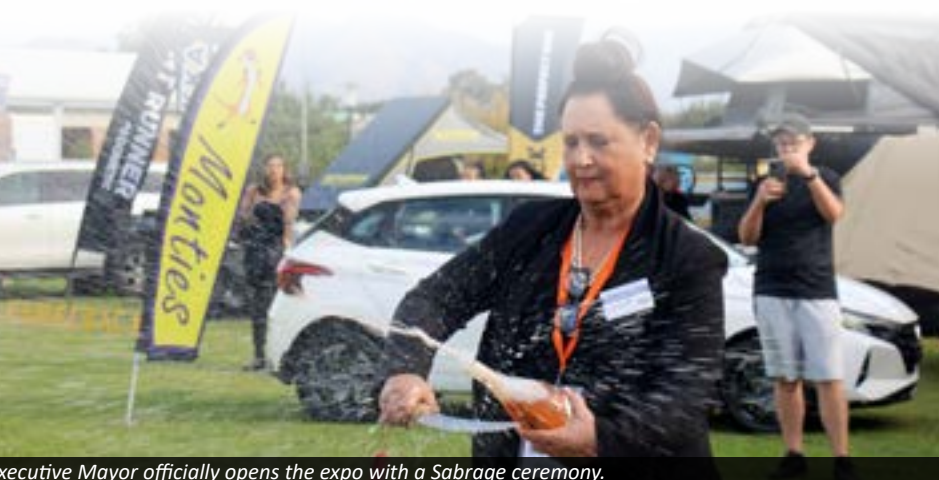
Executive Mayor officially opens the expo with a Sabrage ceremony.