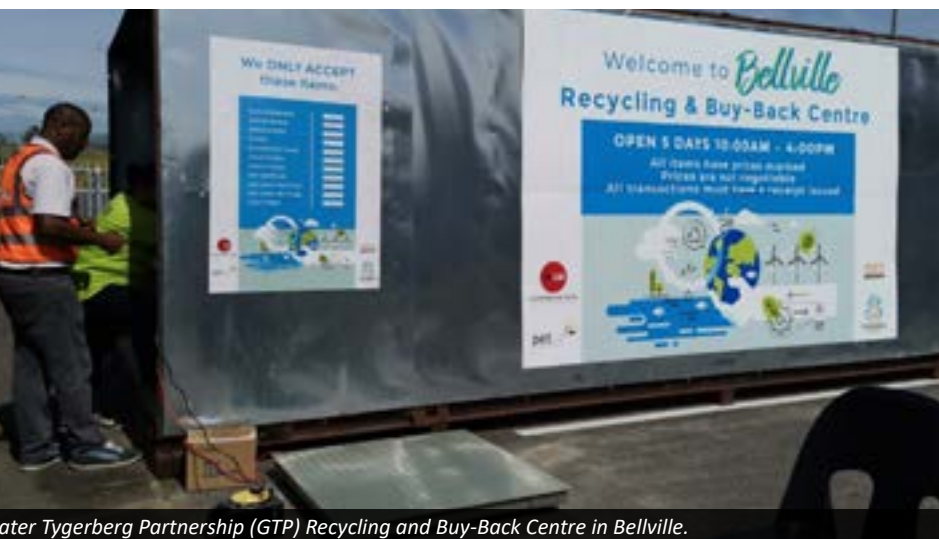
Greater Tygerberg Partnership (GTP) Recycling and Buy-Back Centre in Bellville.