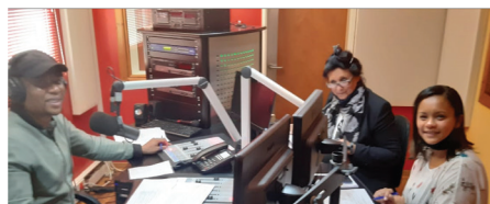
Our IDP took place virtually in 2020.