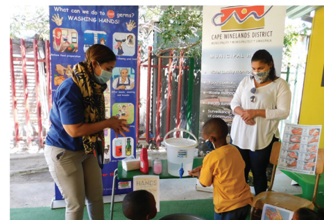
MHS - Global Handwashing Day