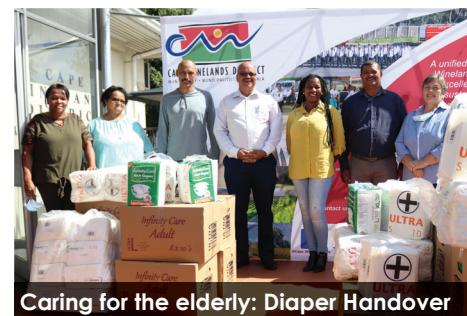
Caring for the elderly: Diaper Handover