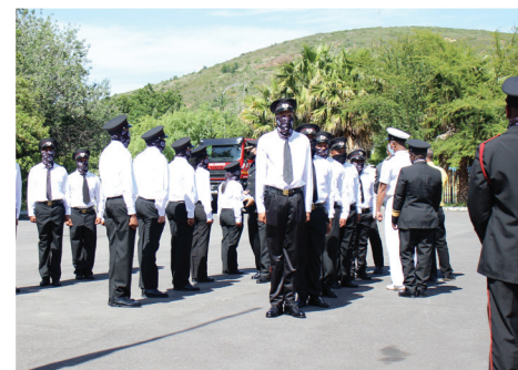
Fire Services Graduation