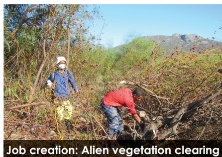
Job creation: Alien vegetation clearing